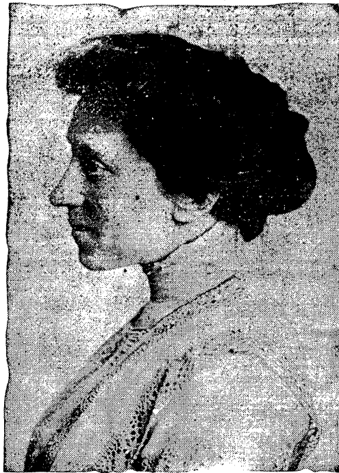
MISS JULIA LATHROP.